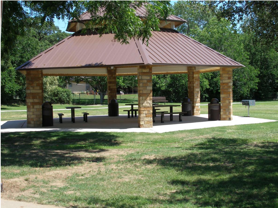
(Smith-Barfield Park Pavilion)

For more information, contact the Hurst Recreation Center Administrative Office 700 Mary Drive Hurst, TX 76053 817.788.7320 www.hursttx.gov