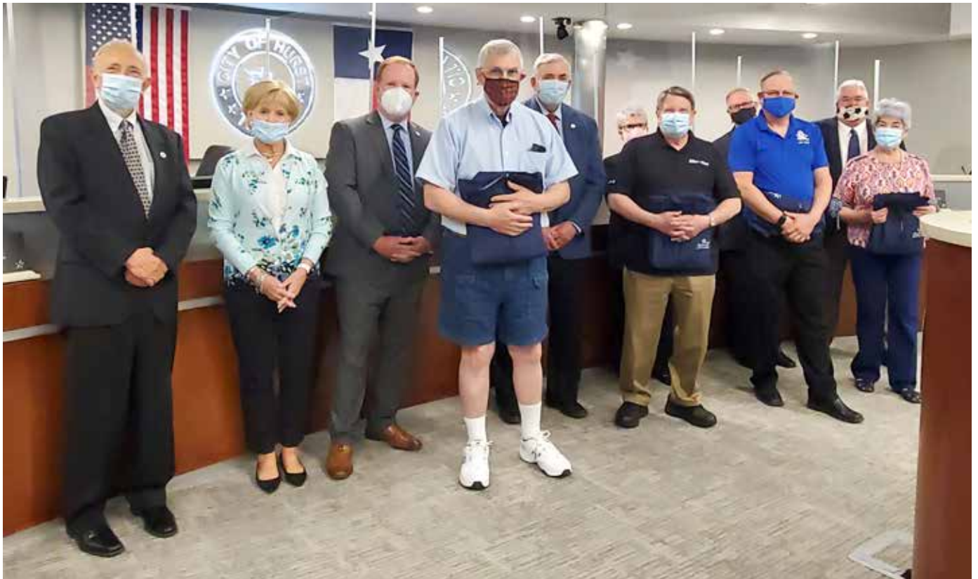
City Council helped recognize volunteers who reached over 200 volunteer hours.