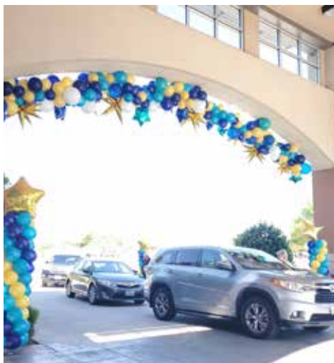
Volunteers were recognized for their dedicated service during a drive-thru event.

This past April, we celebrated our wonderful volunteers during National Volunteer Appreciation Month.