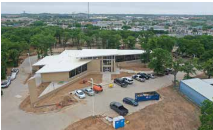
Aerial shot of the facility.

The City of Hurst's new Animal Services and Adoption Center and dog park will be opening soon! Look for more information on these exciting new facilities through our website and social media outlets.