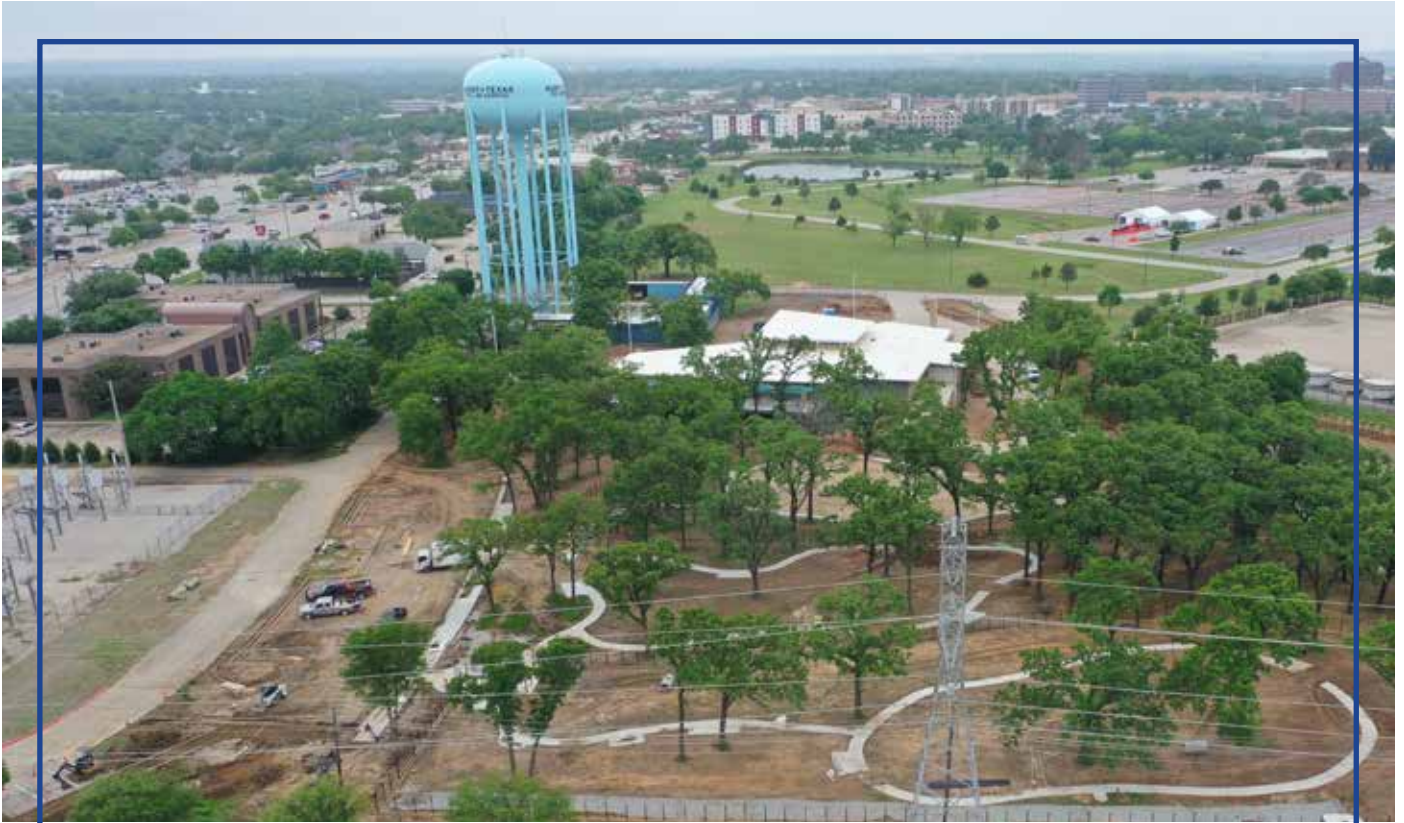
Aerial shot of the new facility and dog park.