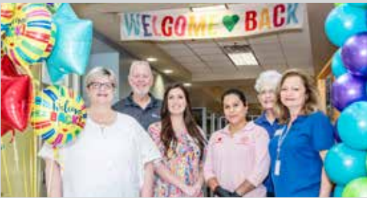
Above: Hurst Senior Activities Center staff pose under a welcome back sign. Right: A visitor gives a thumbs-up after his workout.