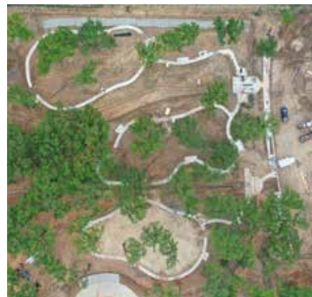
Aerial shot of the dog park.