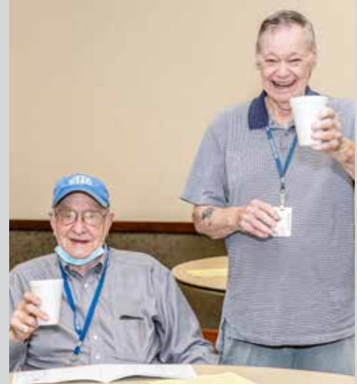
Hurst Senior Activities Center members work-out in the gym and enjoy coffee during the facility's re-opening celebration.