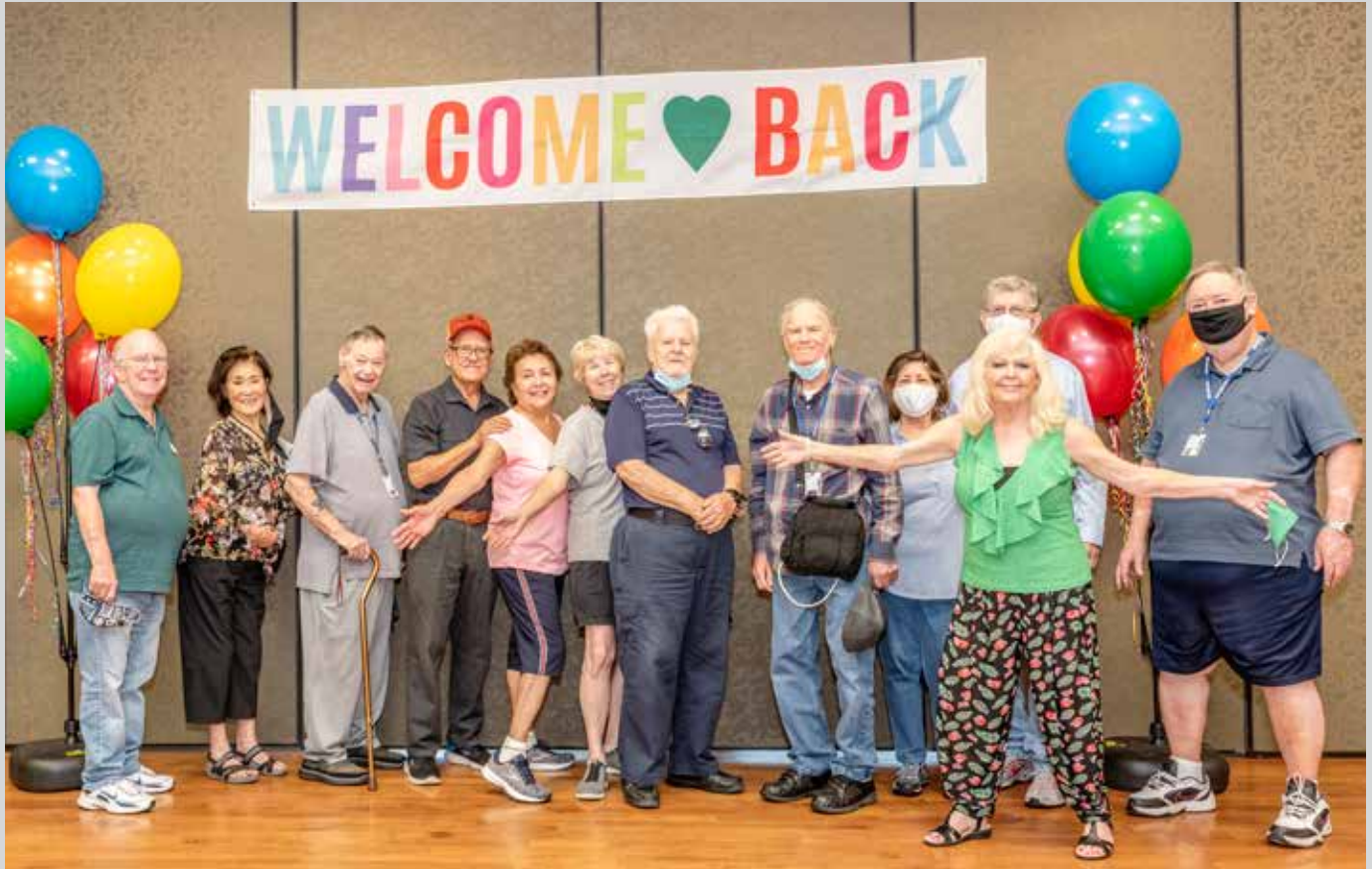
A group of Hurst Senior Activities Center members pose for the camera on May 3 during a re-opening celebration for the facility following its closure for COVID-19 during the pandemic.